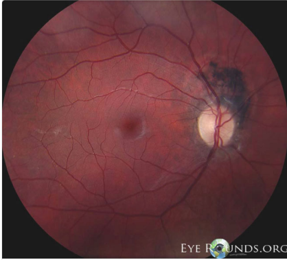
Related Atlas Entry: Melanocytoma of optic nerve