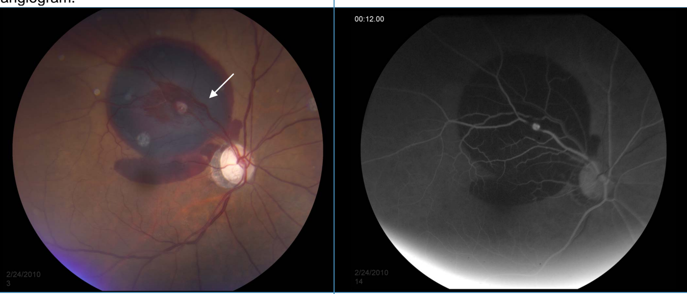
1C: Mid-venous phase of FFA shows increased hyperfluorescence.

1B: FFA of the right eye in the early arteriolar phase showing early hyperfluorescence along the superotemporal arcade over the subjacent blockage from subretinal hemorrhage.