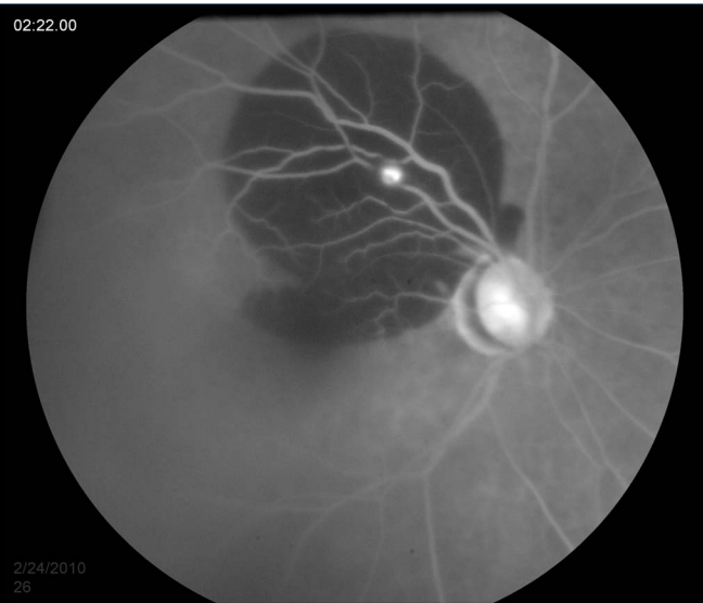
1D: Late or washout phase of FFA shows persistent lesion hyperfluorescence.