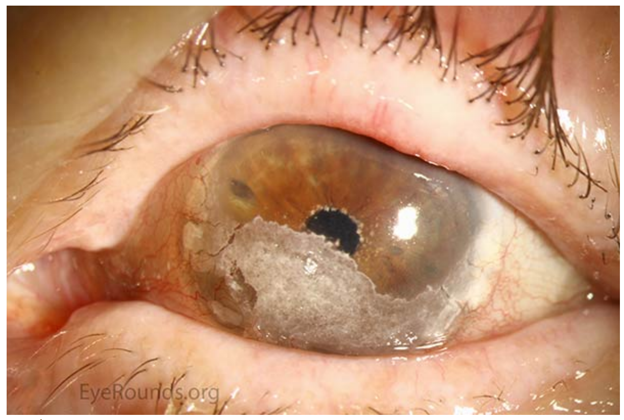
Figure 3. Late band keratopathy displaying a chalky, white consistency.