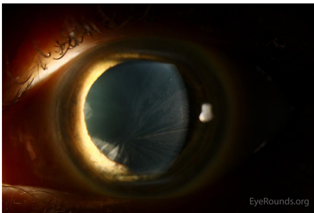
Figure 1: Slit lamp photos of the right eye exhibiting the whorled pattern of corneal verticillata