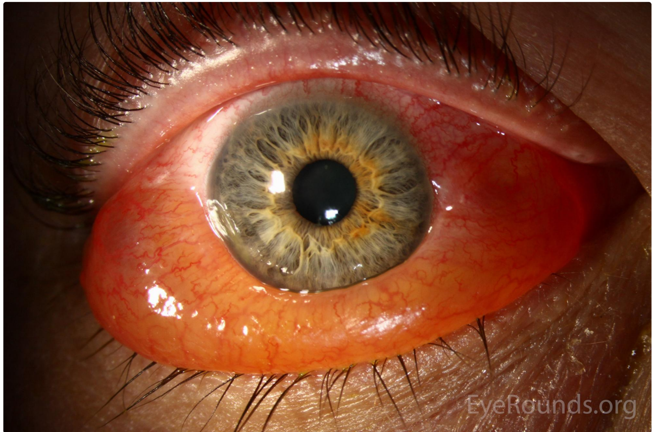
Right eye : Minimal edema of right upper and lower eyelids, 4+ bullous chemosis from 0200 to 0930 with 2+ diffuse injection, mild inferotemporal thinning (dellen) at the limbus

This 51-year-old man presented with acute onset of binocular diplopia, injected eyes, and periocular swelling that was initially diagnosed as episcleritis but worsened despite lubrication and topical steroids. Examination was remarkable for a restrictive strabismus, right upper and lower eyelid retraction, and right greater than left inferior chemosis. Additional imaging and serology testing confirmed the diagnosis of thyroid eye disease (TED). In the early presentation of thyroid eye disease, patients may experience chemosis, conjunctival injection, and eyelid swelling secondary to orbital congestion. For more information on TED, see the EyeRounds TED tutorial .