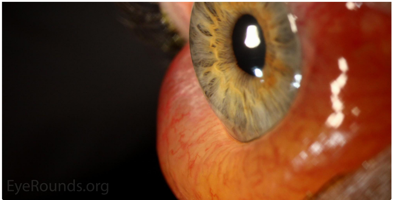
Right eye : Minimal edema of right upper and lower eyelids, 4+ bullous chemosis from 0200 to 0930 with 2+ diffuse injection, mild inferotemporal thinning (dellen) at the limbus