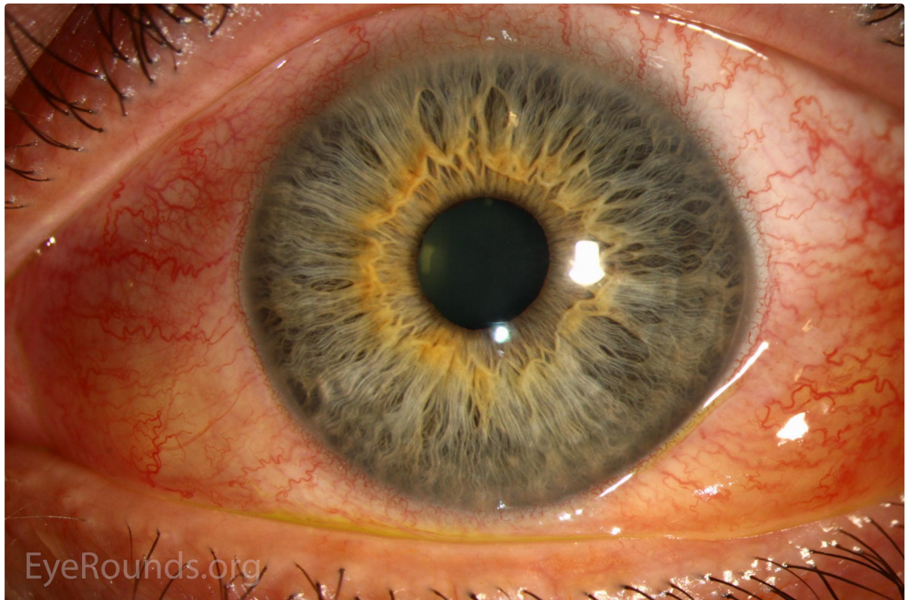
Left eye: Minimal edema of left upper and lower eyelids, 2+ diffuse chemosis with 1+ diffuse injection.