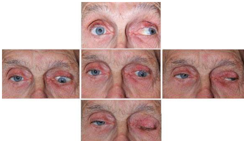
Figure 1: Photos of extraocular movements demonstrating left adduction and supraduction deficit.

External: OD – prosthesis with fat atrophy. OS – fat atrophy.