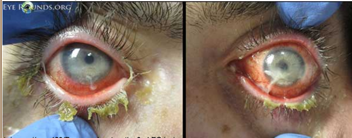
Figure 2. Slit lamp exam demonstrated blepharitis, conjunctival injection most prominent inferiorly, mucopurulent conjunctival discharge, large inferior corneal epithelial defects with a linear superior border, and corneal stromal thinning (dellen).

(../cases-i/case189/Exposure-keratopathy-2a-LRG.jpg)