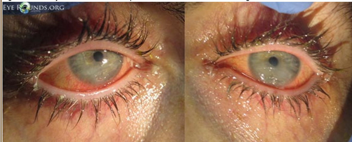
Figure 3. One day after treatment with topical antibiotic solution and lubricating ointment

(../cases-1/case189/Exposure-keratopathy-3-LRG.jpg)