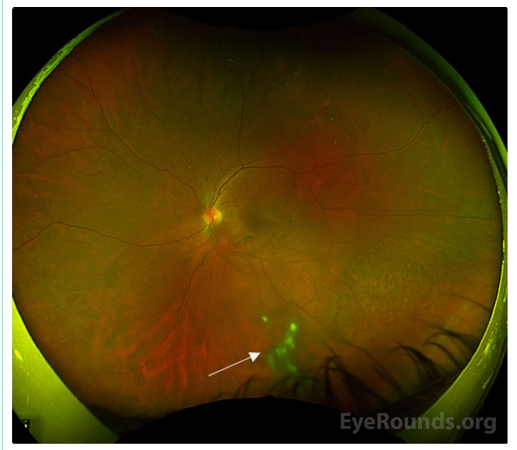
Figure 1: Color Fundus Photography. Color fundus photography of the left eye at presentation demonstrating vitreous cell and floaters with snowballs inferiorly (arrow).