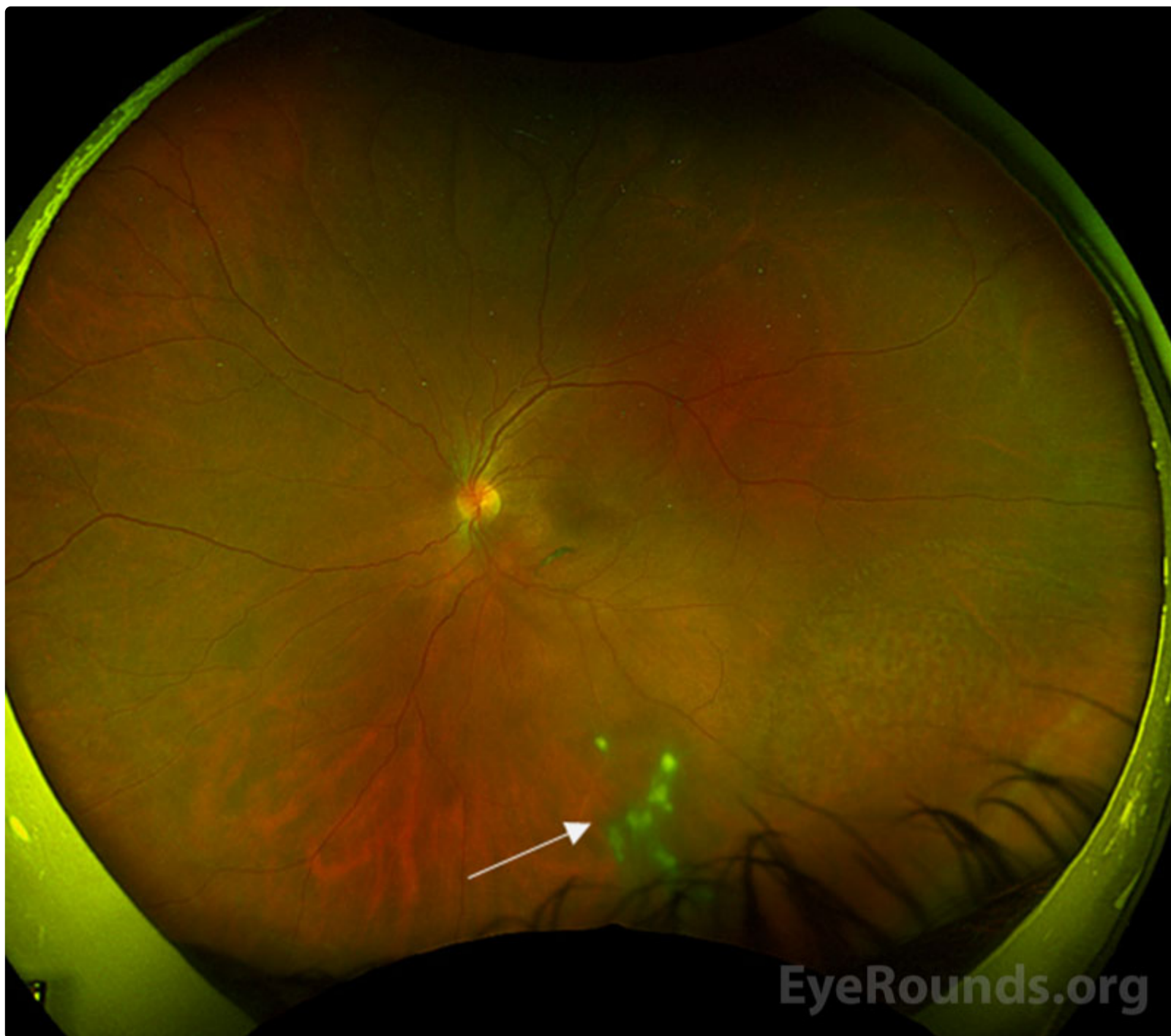
Figure 1: Color Fundus Photography. Color fundus photography of the left eye at presentation demonstrating vitreous cell and floaters with snowballs inferiorly (arrow).