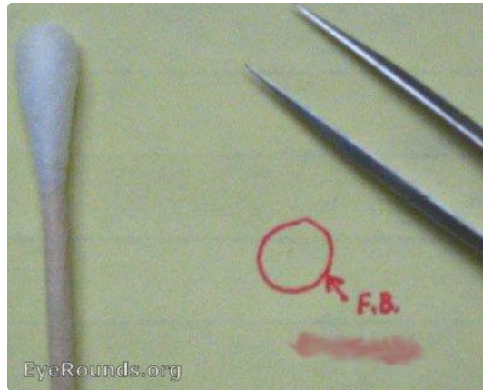
Be aware that tiny foreign bodies could be easily missed, as was the case for this patient seen at another facility only two days before this visit for similar complaints.