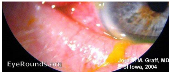
The tiny shred of a thistle is evident on the tarsal surface of the upper lid.