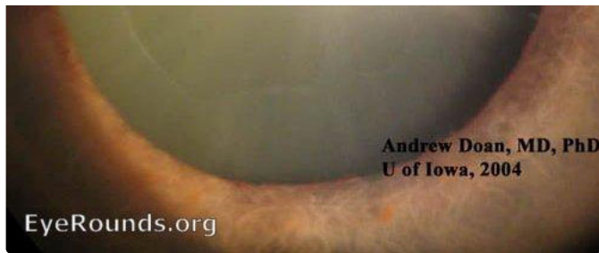
2) bullseye lesion on lens capsule