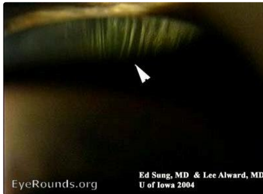
4) pseudoexfoliation material on lens zonules (causes zonular weakness)