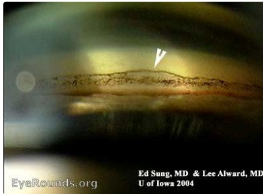
3) Sampaolesi's line on gonioscopy