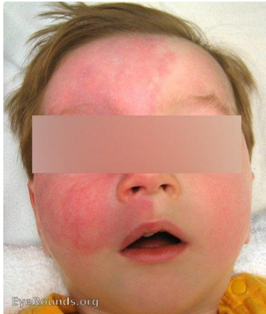
1) port wine stain along dermatomal distribution