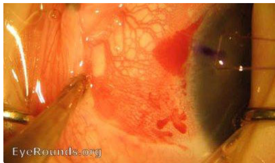
3) Dilated episcleral vessels due to increased episcleral venous pressure.