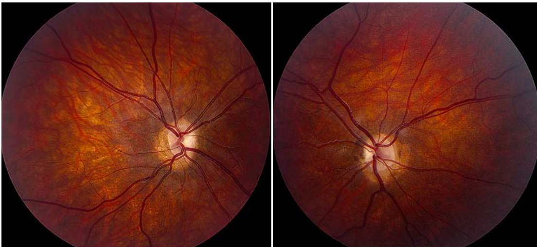
Figure 1: Dilated fundus exam